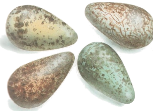
Tzarsira va toloyo ato dye milafko ke tcubay tir meroztacka, kore va konako decemoyo co rindet. Bata gedruca ta tcauteru va ato gan tcubay dintalasi kal zverio mende nuyoridar. Bata ra gan lanyona bagalara zo rozackaylar.