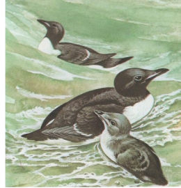
Brünnich tcubay va kabay dabon malestur : i va bakami is halado is saluk is bivedo. Grupujeyer ise va 40 ik 50 versat leve lavek rodetackar ise kal titayee vas 18 m-, rodetobtar. Pujeteson, va vittreem dekon zanudar millinde koe rid co talar.